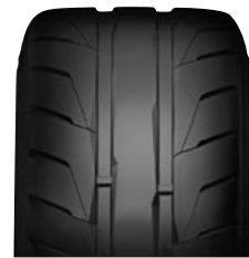
NT-05 SIZES 17 | 18 | 19 | 20