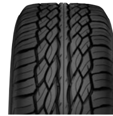
ZIEX S/TZ05 SIZES 16 | 17 | 18 | 19 | 20 22 | 24