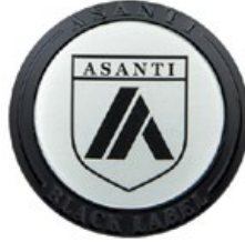
GLOSS BLACK PASSENGER-C-100FABBN SUV/TRUCK-C-100FSUVBN