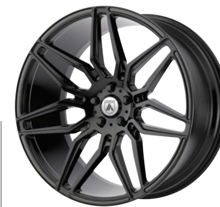
ABL-11 GLOSS BLACK