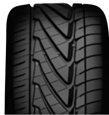
NEO GEN SIZES 15 | 16 | 17 | 18 | 19 20 | 22