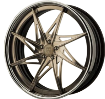
CX848 Shown with optional billet cap.