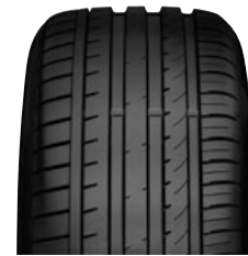
AZENIS FK453 SIZES 17 | 18 | 19 | 20 | 22