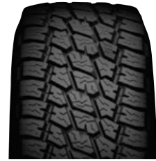
TERRA GRAPPLER SIZES 16 | 17 | 18 | 22 | 24