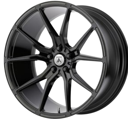
ABL-13 GLOSS BLACK