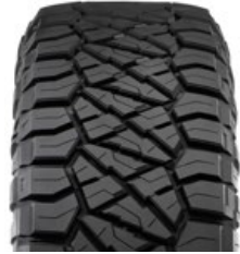
RIDGE GRAPPLER SIZES 17 | 18 | 20 | 22