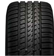
AZENIS FK450 A/S SIZES 16 | 17 | 18 | 19 | 20