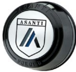
GLOSS BLACK C-100FSUVBN