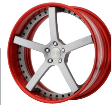
CX854 Shown with optional billet cap.