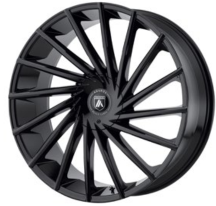
ABL-18 GLOSS BLACK