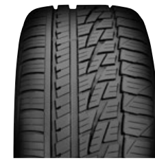
ZIEX ZE950 A/S SIZES 15 | 16 | 17 | 18 | 19 | 20