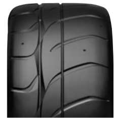
NT-01 SIZES 14 | 15 | 16 | 17 | 18 | 20