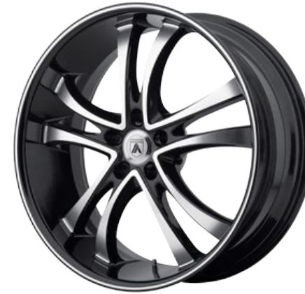
ABL-06 MACHINED FACE W/ BLACK LIP