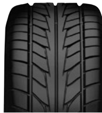
NT555 EXTREME ZR SIZES 17 | 18 | 19 | 20 | 22