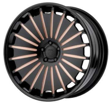
CX849 Shown with optional billet cap.