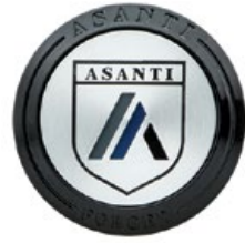
GLOSS BLACK C-100FFABN