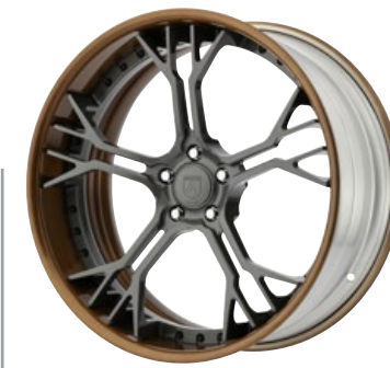
CX855 Shown with optional billet cap.