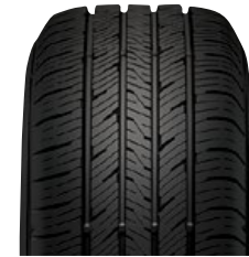
SINCERA SN250 A/S SIZES 14 | 15 | 16 | 17 | 18