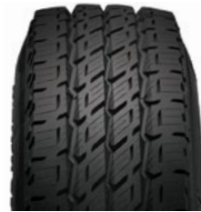
DURA GRAPPLER SIZES 16 | 17 | 18 | 20 | 22