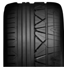
NT INVO SIZES 17 | 18 | 19 | 20 | 22 | 24