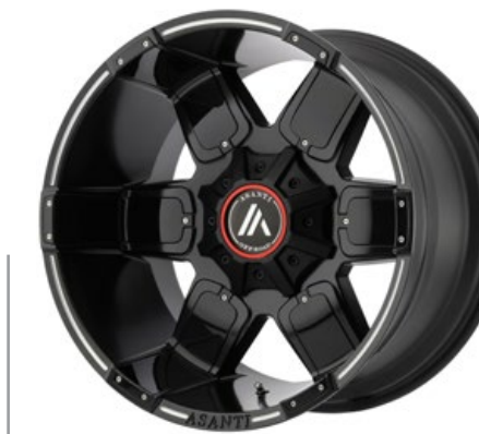
AB811 SATIN BLACK MILLED W/ BLACK ACCENTS