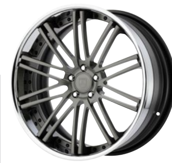
CX856 Shown with optional billet cap.