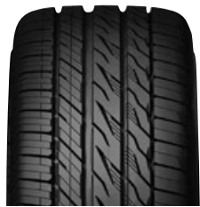
MOTIVO SIZES 17 | 18 | 19 | 20