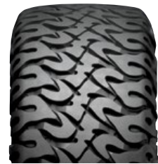
DUNE GRAPPLER SIZES 17 | 18 | 20