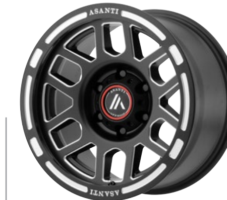
AB812 SATIN BLACK MILLED