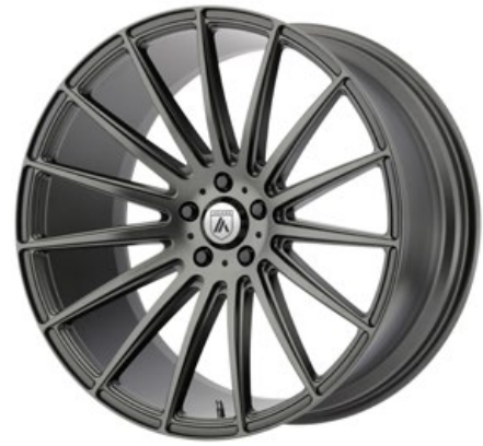
ABL-14 MATTE GRAPHITE