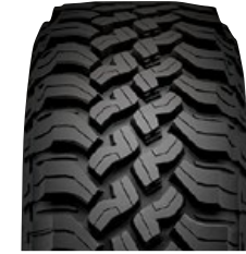
WILDPEAK M/T SIZES 15 | 16 | 17 | 18 | 20