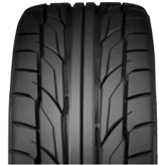
NT555 G2 SIZES 17 | 18 | 19 | 20