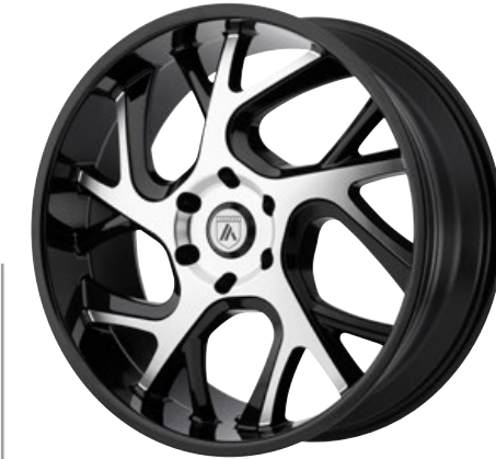
ABL-16 GLOSS BLACK MACHINED