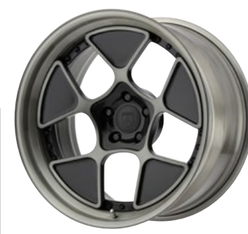
CX860 Shown with optional billet cap.