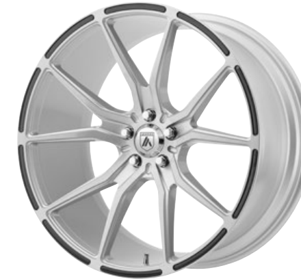
ABL-13 BRUSHED SILVER