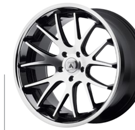
ABL-03 MACHINED FACE W/ BLACK LIP