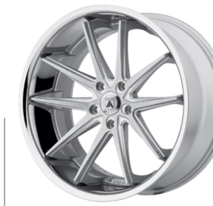
ABL-05 SILVER MACHINED W/ STAINLESS STEEL LIP