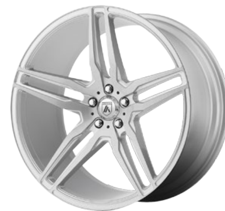
ABL-12 BRUSHED SILVER