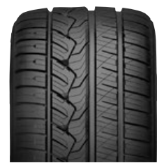
NT 421Q SIZES 17 | 18 | 19 | 20 | 22