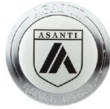
CHROME PASSENGER-C-100FABACN SUV/TRUCK-C-100FSUVCN