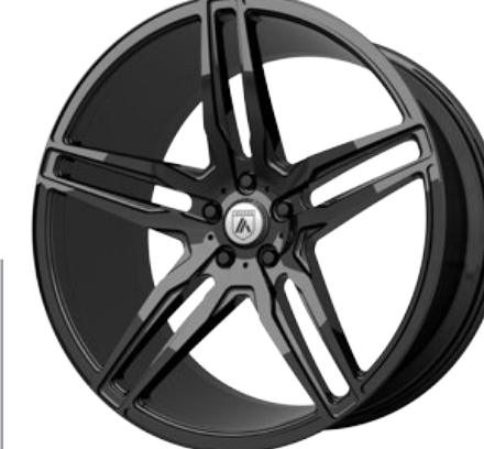
ABL-12 GLOSS BLACK