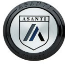
GLOSS BLACK C-100FABN