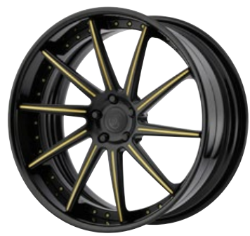
CX853 Shown with optional billet cap.