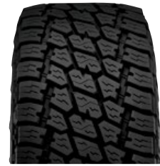
G2 TERRA GRAPPLER SIZES 17 | 18 | 20 | 22