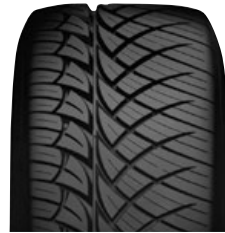
NT420S SIZES 16 | 17 | 18 | 20 | 22 | 24