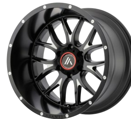
AB807 SATIN BLACK MILLED