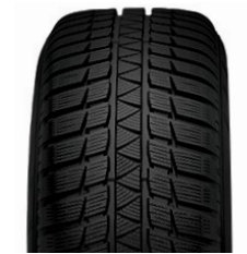
EUROWINTER HS449 SIZES 13 | 14 | 15 | 16 | 17 18 | 19 | 20