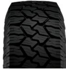
EXO GRAPPLER SIZES 17 | 18 | 20