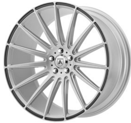
ABL-14 BRUSHED SILVER