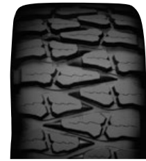
MUD GRAPPLER SIZES 15 | 16 | 17 | 18 | 20 | 22