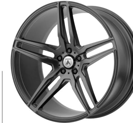
ABL-12 MATTE GRAPHITE