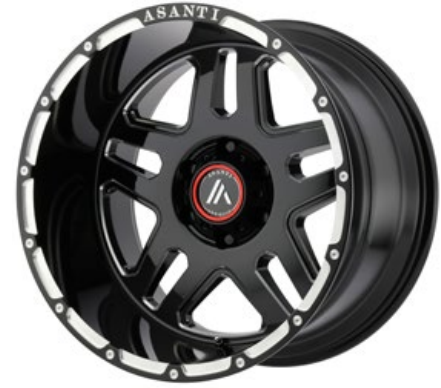
AB809 GLOSS BLACK