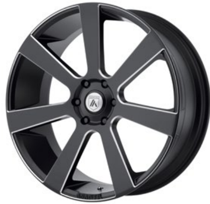
ABL-15 SATIN BLACK MILLED