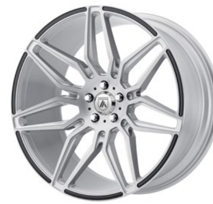
ABL-11 BRUSHED SILVER