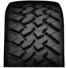
TRAIL GRAPPLER SIZES 15 | 16 | 17 | 18 | 20 22 | 24