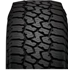
WILDPEAK AT3W SIZES 15 | 16 | 17 | 18 | 20