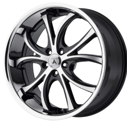
ABL-08 MACHINED FACE W/ STAINLESS STEEL LIP