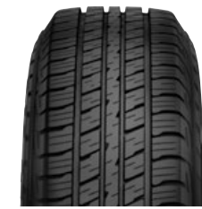
WILDPEAK H/T SIZES 15 | 16 | 17 | 18 | 19 | 20