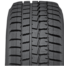
ESPIA EPZ II SIZES 14 | 15 | 16 | 17 | 18