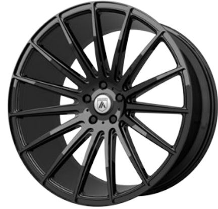
ABL-14 GLOSS BLACK