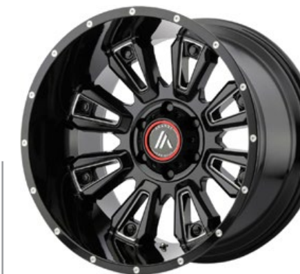
AB808 GLOSS BLACK MILLED