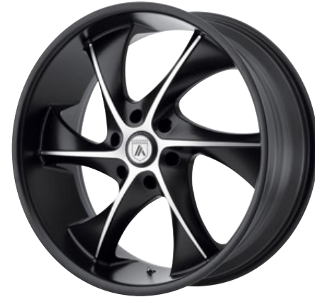
ABL-17 SATIN BLACK MACHINED