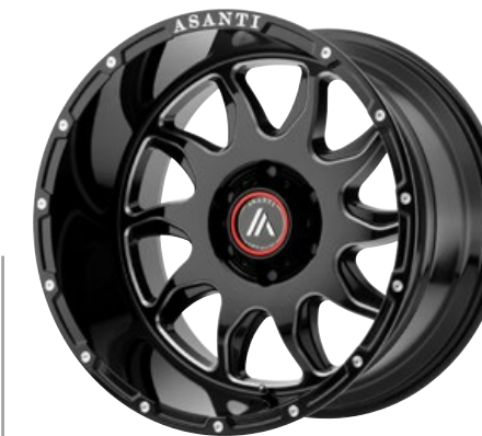
AB810 GLOSS BLACK MILLED