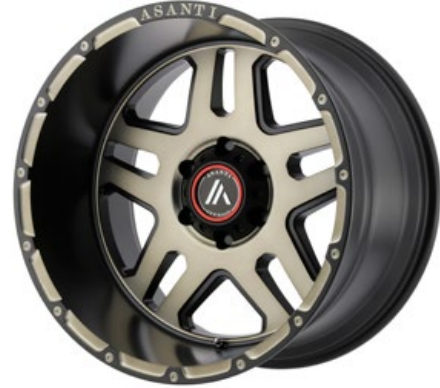
AB809 MATTE BLACK MACHINED W/ TINTED CLEAR