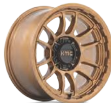
MATTE BRONZE 17, 20 5/6 LUG PATENT PENDING