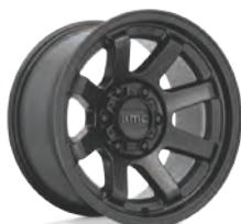
SATIN BLACK 16, 17 5/6 LUG PATENT PENDING