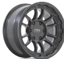
SATIN BLACK 17, 20 5/6 LUG PATENT PENDING