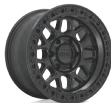
NEW FOR 2022 GRS KM549

SATIN BLACK 17, 18, 20 5/6/8 LUG PATENT PENDING