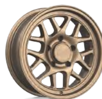
BULLY OL KM717

MATTE BRONZE 16, 17 5/6 LUG PATENT PENDING