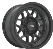
SATIN BLACK 16, 17 5/6 LUG PATENT PENDING