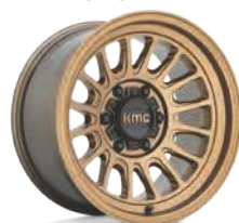
IMPACT OL KM724

MATTE BRONZE 16, 17 5/6 LUG PATENT: D942917