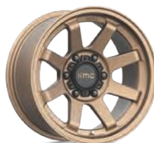
MATTE BRONZE 16, 17 5/6 LUG PATENT PENDING