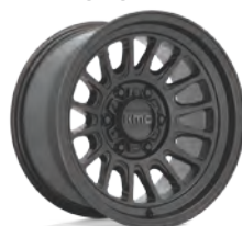
IMPACT OL KM724

SATIN BLACK 16, 17 5/6 LUG PATENT: D942917