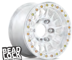
NEW FOR 2022 IMPACT KM445

CRAWL MACHINED 17, 20 5/6/8 LUG PATENT: D937170