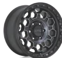
SATIN BLACK W/ GRAY TINT 17 5/6 LUG PATENT: D910525