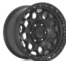
SATIN BLACK 17 5/6 LUG PATENT: D910525