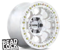
NEW FOR 2022 RIOT KM237

SATIN BLACK W/ MACHINED RING 17 5/6/8 LUG