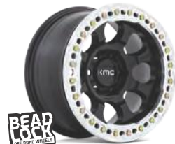
NEW FOR 2022 RIOT KM237

SATIN BLACK W/ MACHINED RING 17 5/6/8 LUG