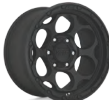
DIRTY HARRY KM541

TEXTURED BLACK 17, 18, 20 5/6/8 LUG PATENT: D894088