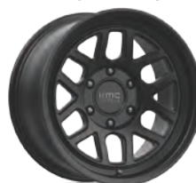
NEW FOR 2022 MESA KM446

FORGED SATIN BLACK 17 5/6/8 LUG PATENT: D920525