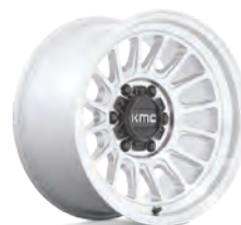
NEW FOR 2022 IMPACT OL KM724

SILVER W/ MACHINED FACE 16, 17 5/6 LUG PATENT: D942917