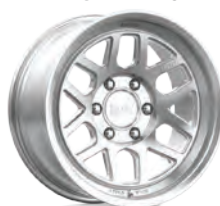
NEW FOR 2022 MESA KM446

FORGED RAW MACHINED 17 5/6/8 LUG PATENT: D920525