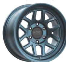
NEW FOR 2022 MESA KM446

FORGED METALLIC BLUE 17 5/6/8 LUG PATENT: D920525