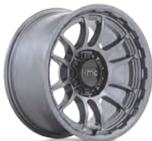
MATTE ANTHRACITE 17, 20 5/6 LUG PATENT PENDING