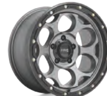
DIRTY HARRY KM541

SATIN GRAY W/ BLACK RING 17, 18, 20 5/6/8 LUG PATENT: D894088