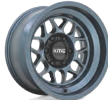
NEW FOR 2022 TERRA KM725

METALLIC BLUE 16, 17 5/6 LUG PATENT PENDING