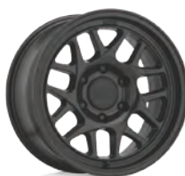
BULLY OL KM717

SATIN BLACK 16, 17 5/6 LUG PATENT PENDING