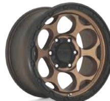
DIRTY HARRY KM541

MATTE BRONZE W/ BLACK RING 17, 18, 20 5/6/8 LUG PATENT: D894088