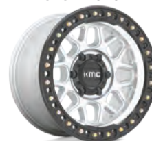
NEW FOR 2022 GRS KM549

MACHINED W/ SATIN BLACK LIP 17, 18, 20 5/6/8 LUG PATENT PENDING