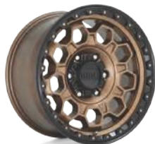
MATTE BRONZE 17 5/6 LUG PATENT: D910525