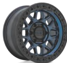
NEW FOR 2022 GRS KM549

MIDNIGHT BLUE W/ GLOSS BLACK LIP 17, 18, 20 5/6/8 LUG PATENT PENDING